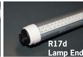
R17d Lamp End