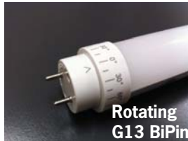
Rotating G13 BiPin