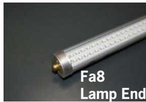
Fa8 Lamp End